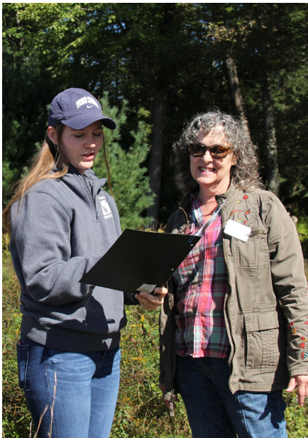
The generous support of the Finley Center's many donors has allowed us to provide opportunities for students to gain valuable hands-on experience engaging with Pennsylvania's forest landowners.