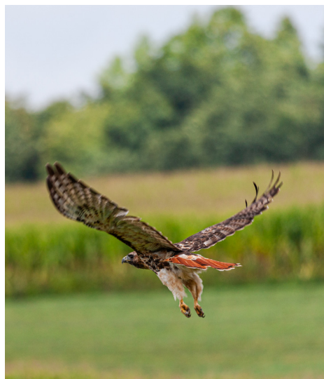
The beauty of a Red-tailed Hawk taking flight.

Stretch the wing muscles, spread the tail feathers, feel the wind, call to the folks and...WHEE!...Here we go!...Whoa... Flap the wings...Losing altitude...Flapping faster now...Falling...I know, mom, the wings are going as fast as they can...What do you mean, relax, dad?...Relax and spread both the wings and the tail WAY out...OK...YEAH...That's better; slowing