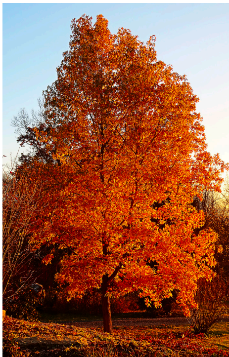
Our sweetgum when it was about 25 years old, in 2018. The fall foliage rivals that of the sugar maple that used to grow in the same spot.

Sweetgum storax, bark, and leaves have an amazing number of medicinal uses. According to a research review article in the National Library of Medicine 1 , knowledge of the medicinal properties of sweetgum dates back to the Aztec Empire, some 10,000 years ago. The ancient Aztecs used storax to treat skin infections and other ailments. Native Americans also used storax for medicinal purposes, as well as burning the sap for incense or mixing it with tobacco leaves as a sedative. Leaf oil from American sweetgum leaves contains the same active ingredient as the Australian tea tree, which is used as an antimicrobial agent. We use tea tree