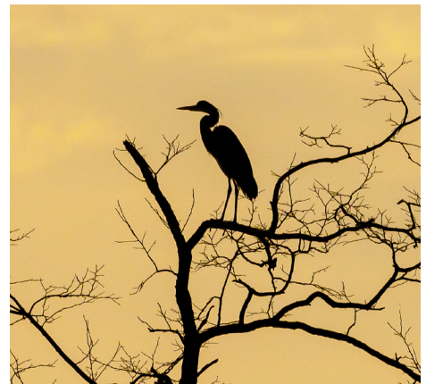
The sunrise turned the sky yellow to form a perfect backdrop for the silhouette of a Great Blue Heron that landed in the tree one spring morning.

We've seen a Bald Eagle, Black Vultures, Turkey Vultures, American Crows, Ravens, Cooper's Hawks, and other birds land in the tree, but the biggest surprise was a Great Blue Heron that perched in the tree early one morning.